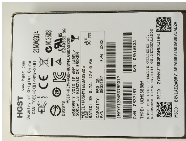
Figure 2 Large Tamper-Evident Label on Top Surface

The Cryptographic Module does not make claims in the Physical Security area beyond FIPS 140-2 Security Level 2.