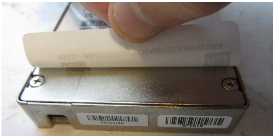
Figure 3 - Lift top label