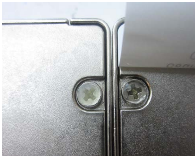
Figure 4 - Left side shows tamper. Right side shows no tamper.