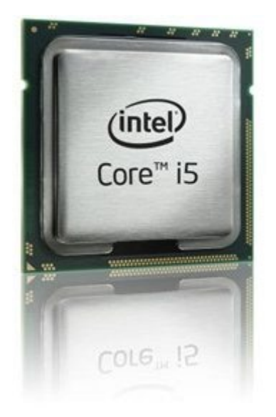
Figure 2 Physical Cryptographic Hardware for AES-NI

The logical cryptographic boundary includes all the software sub-components portion of the hybrid cryptographic module which include: