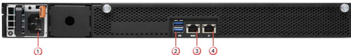
Table 5 – NS-5100/5200 Rear Panel Ports and Connectors