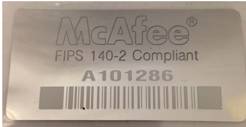
Figure 11 – Tamper-Evident Seal