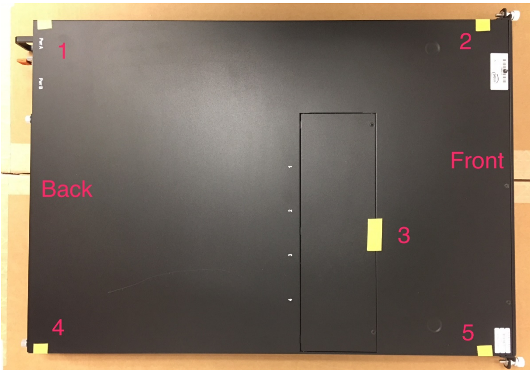
Figure 10 – Tamper Seal Locations (NS5100/NS5200 Sensor – Top Surface)

Figure 11 below is an example of the tamper-evident seals applied to the modules.