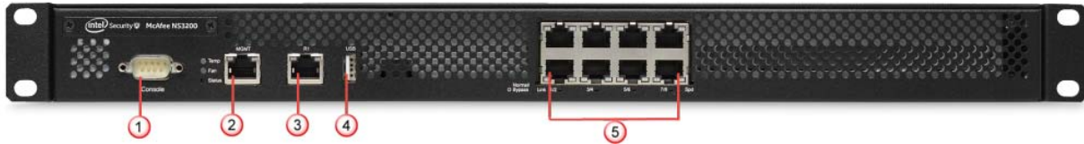
Table 2 – NS-3100/3200 Front Panel Ports and Connectors