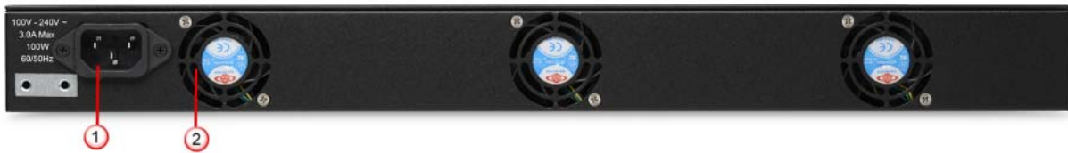
Table 4 – NS-3100/3200 Rear Panel Ports and Connectors