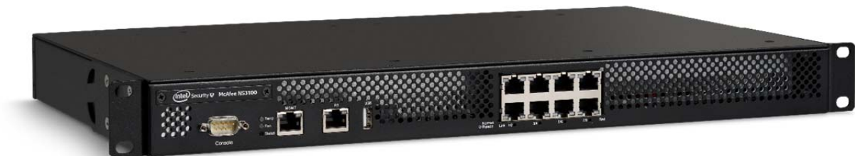
Figure 1 – Image of NS-3100

Figure 1 - Figure 4 show the module configurations and the cryptographic boundaries.