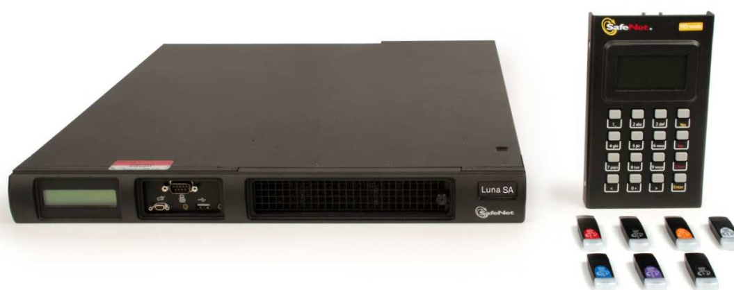
Figure 2-2. SafeNet Network HSM (with SafeNet PCIe Installed), SafeNet PED and iKeys