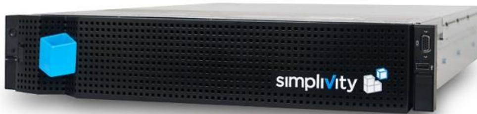
Figure 1 – HPE SimpliVity OmniCube

HPE packages their hyperconverged infrastructure solution on enterprise-grade x86 platform called the OmniCube (see Figure 1 below). The OmniCube is sold with the HPE software components and the OAC on a 2U server with an Intel Xeon processor and VMware ESXi v5.5 or 6.0 running Ubuntu 14.04.5 LTS 3 . The OmniCube is available in several hardware models that scale for the appropriate workload by offering varying amounts of storage capacity, number of cores, and virtual machine support.