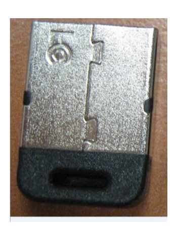
Figure 1 depicts the Module at the cryptographic boundary.