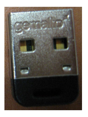
Figure 1 - eToken 5300 Micro Crypto Boundary