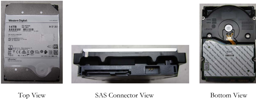
Figure 1: Ultrastar DC HC530 Cryptographic Boundary

The self-encrypting Ultrastar® DC HC530 TCG Enterprise HDD , hereafter referred to as “Ultrastar DC HC530” or “Cryptographic Module”, is a multi-chip embedded module that complies with FIPS 140-2 Level 2 security. The Ultrastar DC HC530 complies with the Trusted Computing Group (TCG) SSC: Enterprise Specification . The drive enclosure defines the cryptographic boundary. See Figure 1: Ultrastar DC HC530 Cryptographic Boundary. The SIO port pins shown to the right of the SAS connector, in Figure 1 are disabled in FIPS Approved Mode and non-Approved Mode. Except for the four-conductor motor control cable, all components within the cryptographic boundary tested as compliant with FIPS 140-2 requirements. The control cable is not security relevant and therefore excluded from FIPS 140-2 requirements. The Ultrastar DC HC530 complies with the Advanced Format (AF) standard. The logical storage of user data is unaffected by the formatting method for drives that comply with the Advanced AF standard. 4Kn and 512e formatting organize user data on the physical media in the same manner. The emulation layer employed in 512e drives only services to organize the data in 512-byte chunks for processing by the host. Format method is not security relevant and therefore excluded from FIPS 140-2 requirements.