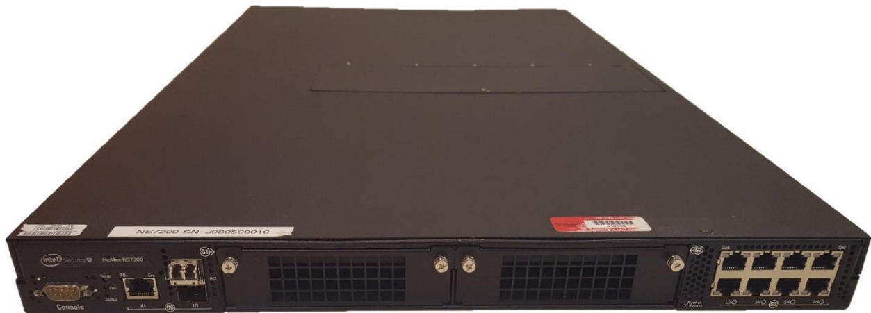
Figure 1 – Image of NS7100/NS7200/NS7300

The cryptographic boundary is the outer perimeter of the enclosure, including the removable power supplies and fan trays. (The power supplies and fan trays are excluded from FIPS 140-2 requirements, as they are not security relevant.) Optional network I/O modules are not included in the module boundary. Figure 1 shows the module configuration and the cryptographic boundary.