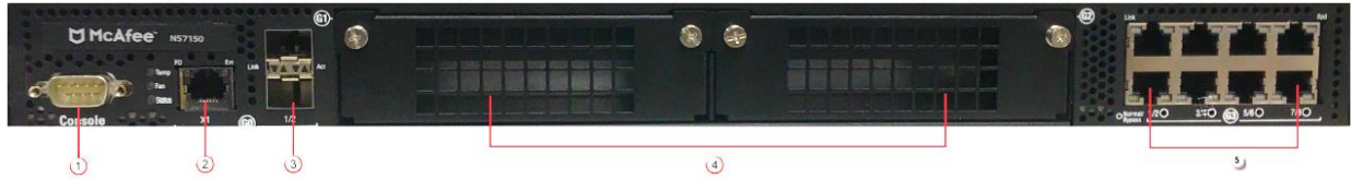
Table 2 –NS7100/NS7200/NS7300 Front Panel Ports and Connectors