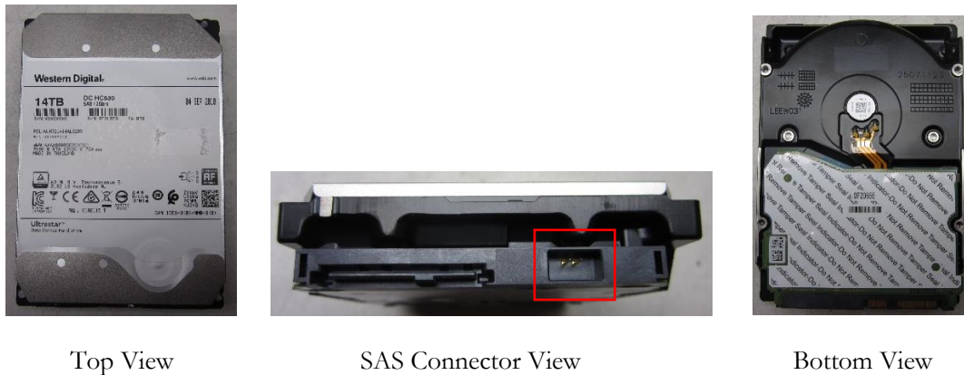
Figure 1: Ultrastar DC HC530 Cryptographic Boundary

The self-encrypting Ultrastar DC HC530 TCG Enterprise HDD , hereafter referred to as “Ultrastar DC HC530” or “Cryptographic Module”, is a multi-chip embedded module that complies with FIPS 140-2 Level 2 security. The Ultrastar DC HC530 complies with the Trusted Computing Group (TCG) SSC: Enterprise Specification . The drive enclosure defines the cryptographic boundary. See Figure 1: Ultrastar DC HC530 Cryptographic Boundary. The SIO port pins shown to the right of the SAS connector, in Figure 1 are disabled in FIPS Approved Mode and non-Approved Mode. Except for the four-conductor motor control cable, all components within the cryptographic boundary tested as compliant with FIPS 140-2 requirements. The control cable is not security relevant and therefore excluded from FIPS 140-2 requirements. The Ultrastar DC HC530 complies with the Advanced Format (AF) standard. The logical storage of user data is unaffected by the formatting method for drives that comply with the Advanced AF standard. 4Kn and 512e formatting organize user data on the physical media in the same manner. The emulation layer employed in 512e drives only services to organize the data in 512-byte chunks for processing by the host. Format method is not security relevant and therefore excluded from FIPS 140-2 requirements.