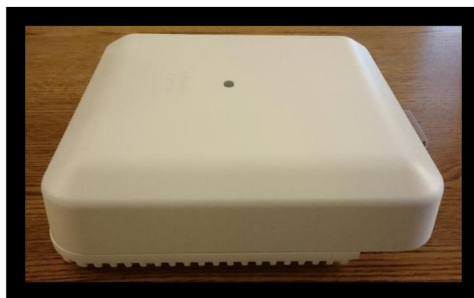
Figure 15: Left

From left to right: Console port, USB port, Ethernet port, POE port, Dc Power-In