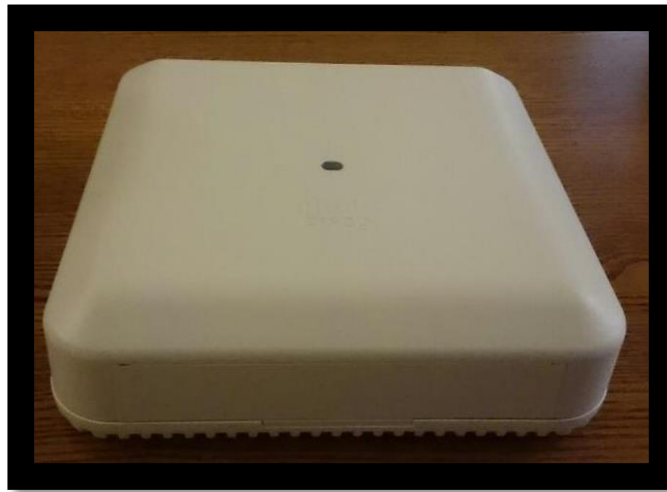
Figure 13: Front