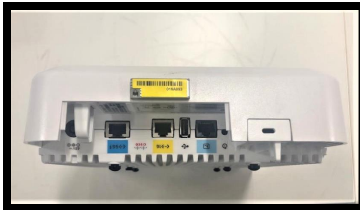
Figure 26: Back

From left to right: DC Power-In, POE port, 5 gig Ethernet port, 1 gig Ethernet Port, USB port, Console port