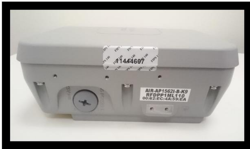
Figure 34: TEL Placement 5