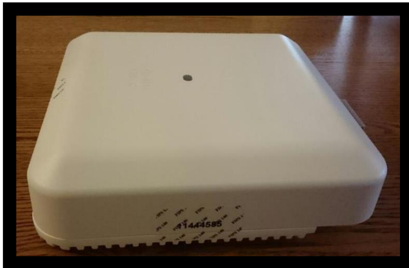
Figure 40: TEL Placement 2