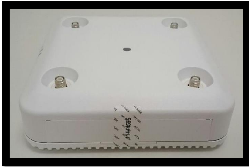
Figure 46: TEL Placement 4