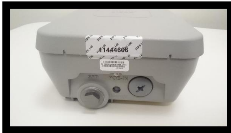
Figure 31: Tel Placement 1