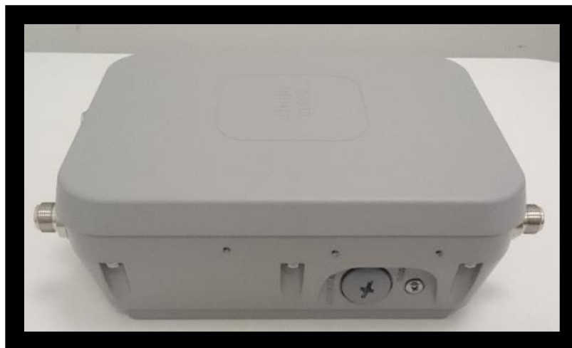
Figure 10: Right

The covering screw hides the console connection.