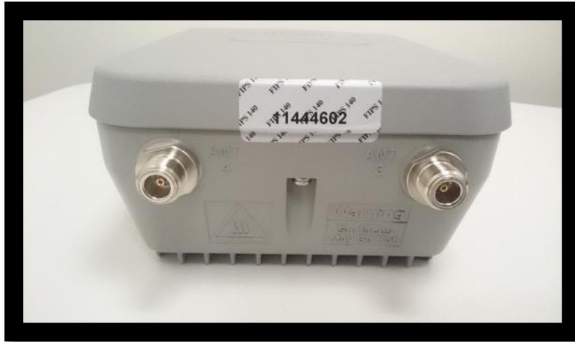
Figure 36: TEL Placement 2