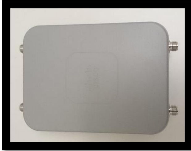
Figure 11: Top