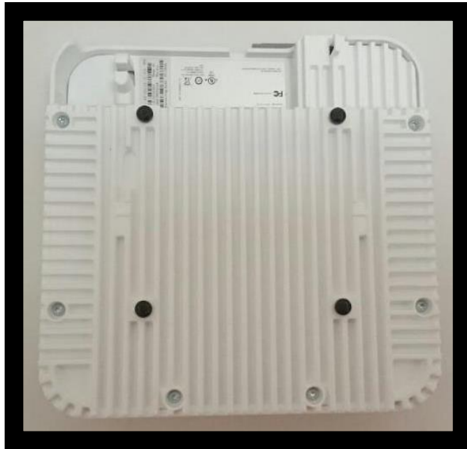
Figure 24: Bottom