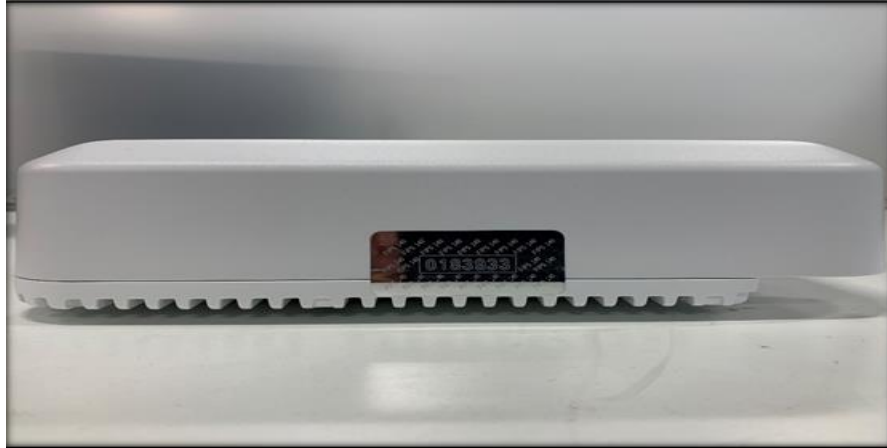
Figure 48: TEL Placement 2