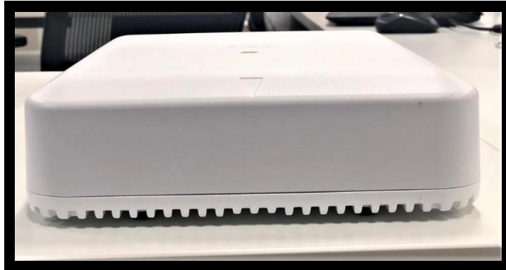
Figure 25: Front