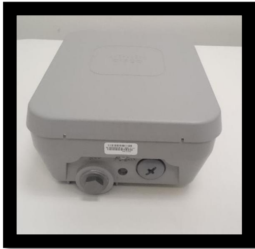
Figure 1: Front

The left-hand bolt on the front is for the SFP port. The right-hand screw on is hides an ethernet/POE port.