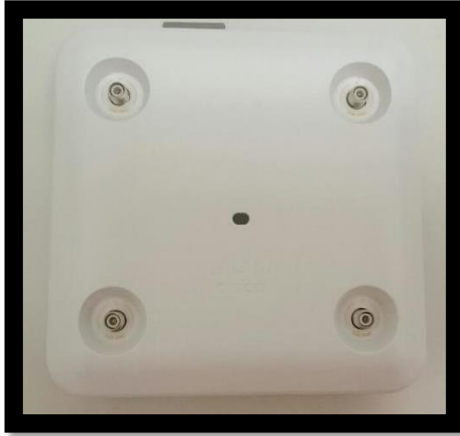
Figure 23: Top