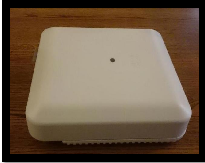
Figure 16: Right