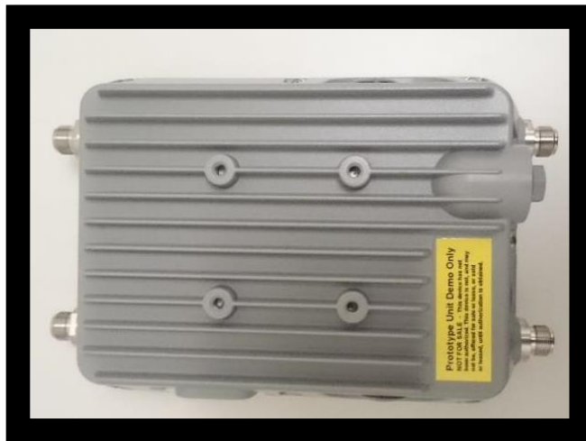
Figure 12: Bottom