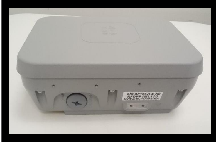
Figure 3: Left