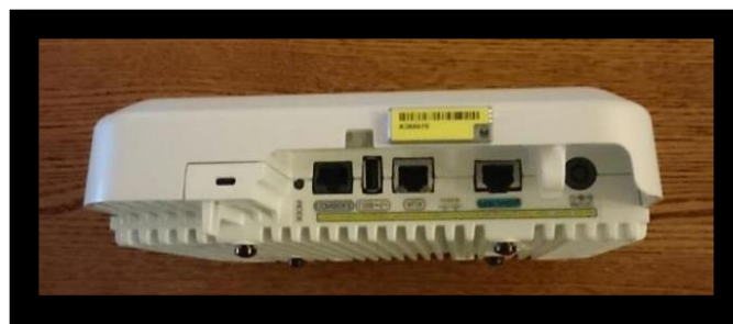
Figure 14: Back

From left to right: Console port, USB port, Ethernet port, POE port, Dc Power-In