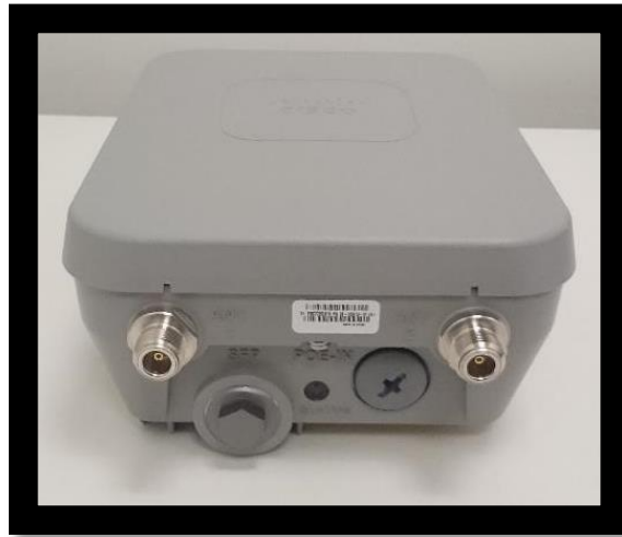
Figure 7: Front

The silver ports are the external antenna ports. The other two are mentioned in Figure 1.