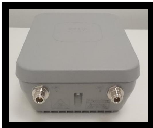
Figure 8: Back

The silver ports are the external antenna ports. The other two are mentioned in Figure 1.