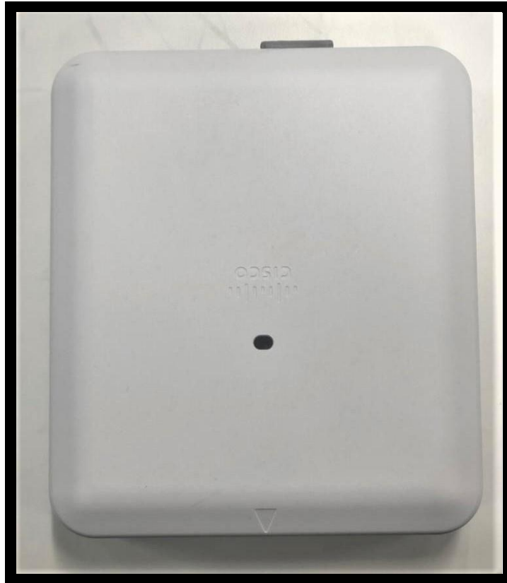
Figure 29: Top