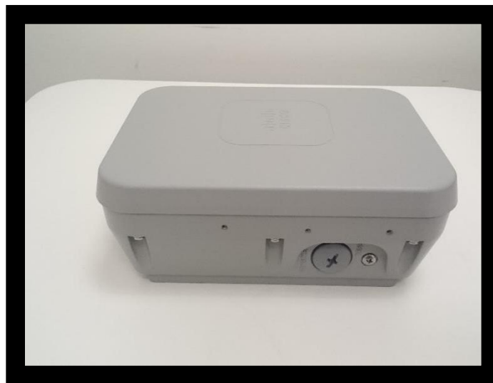
Figure 4: Right

The covering screw hides the console connection.