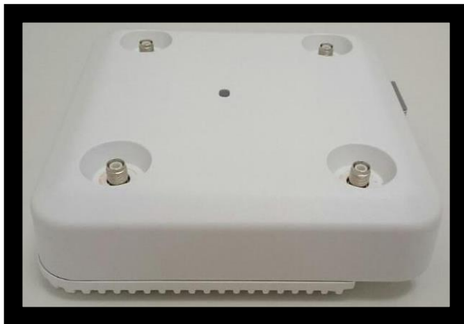
Figure 22: Left