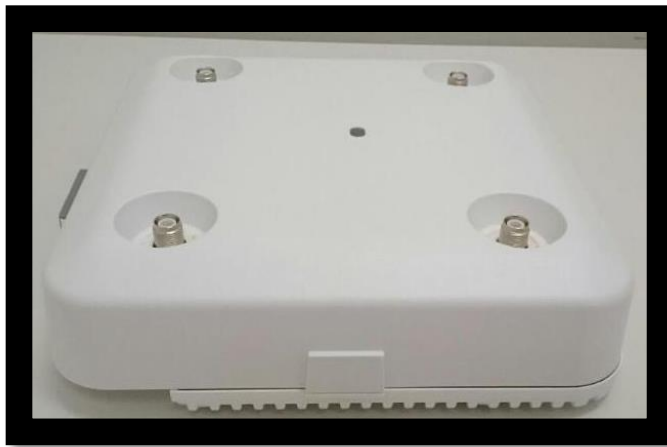
Figure 21: Right

From left to right: DC Power-In, POE port, Ethernet port, USB port, Console port.