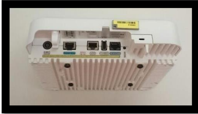
Figure 20: Back

From left to right: DC Power-In, POE port, Ethernet port, USB port, Console port.