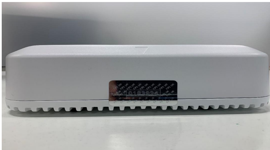
Figure 50: TEL Placement 4