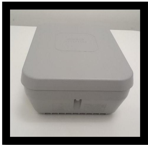
Figure 2: Rear

The left-hand bolt on the front is for the SFP port. The right-hand screw on is hides an ethernet/POE port.