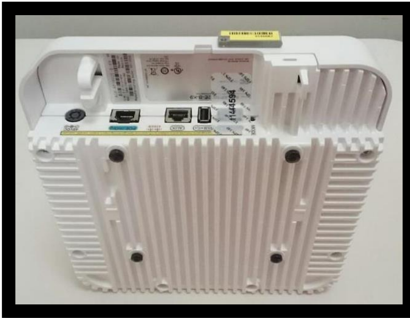
Figure 45: TEL Placement 3