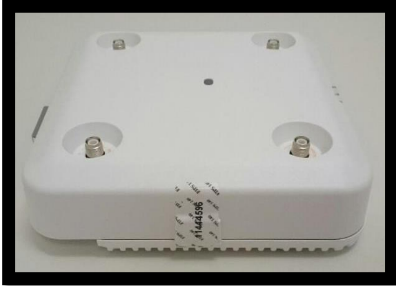
Figure 44: TEL Placement 2