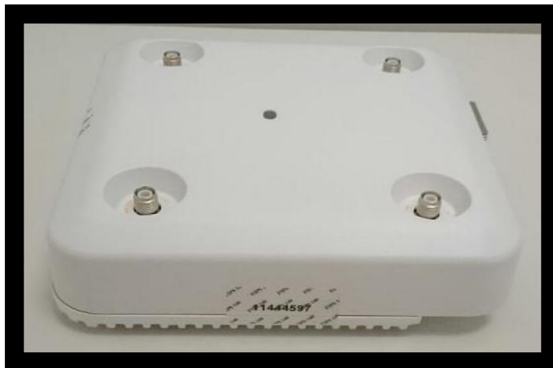
Figure 43: TEL Placement 1