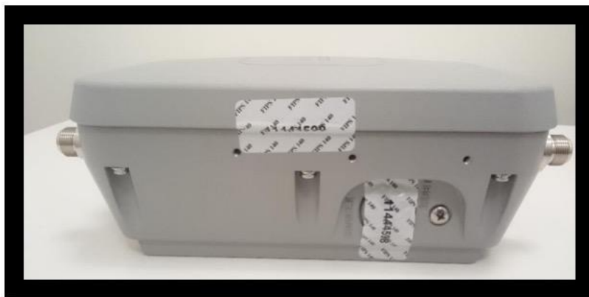
Figure 37: TEL Placement 3 and 4