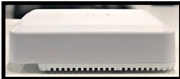
Figure 27: Right

From left to right: DC Power-In, POE port, 5 gig Ethernet port, 1 gig Ethernet Port, USB port, Console port