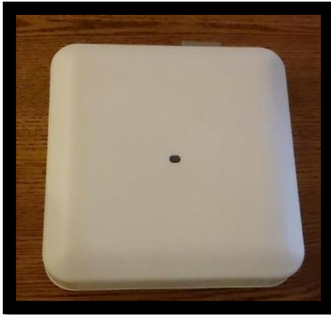
Figure 17: Top