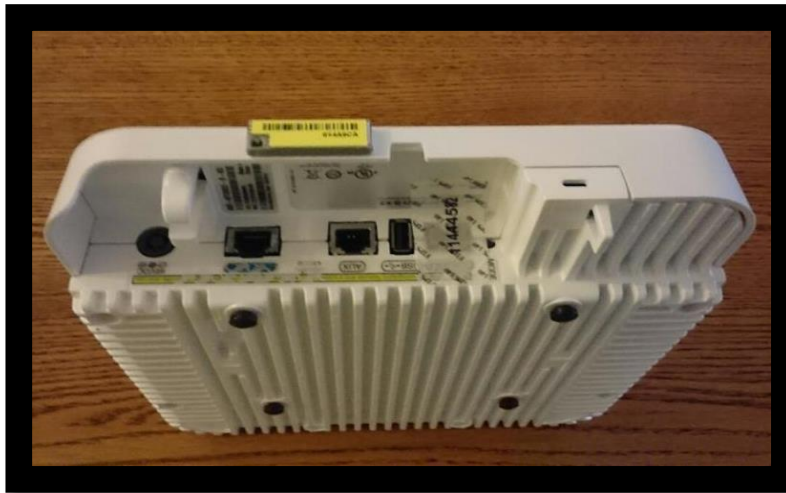
Figure 42: TEL Placement 4