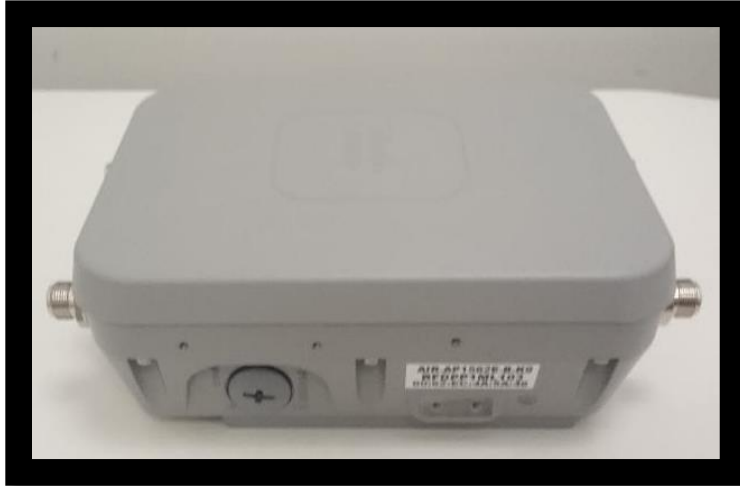
Figure 9: Left