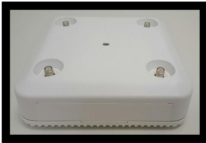
Figure 19: Front