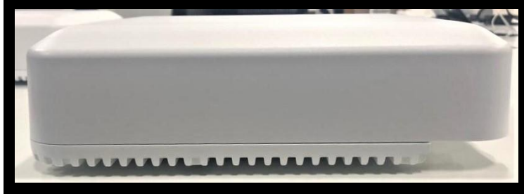
Figure 28: Left