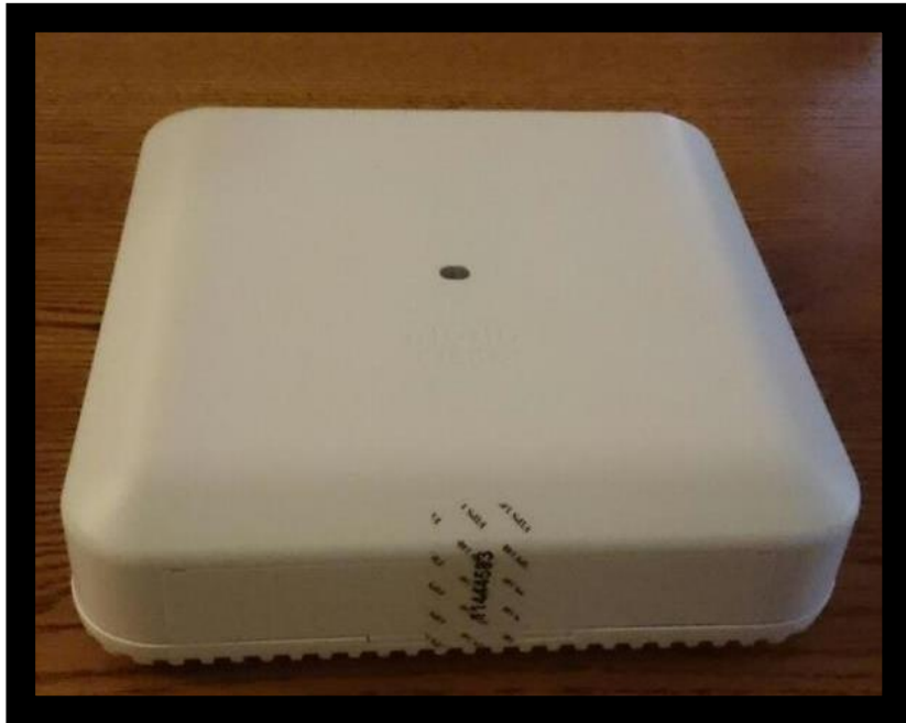
Figure 39: TEL Placement 1