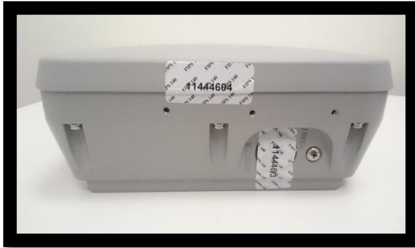
Figure 33: TEL Placement 3 and 4