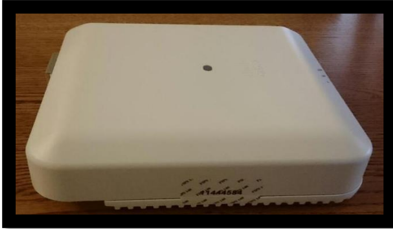
Figure 41: TEL Placement 3