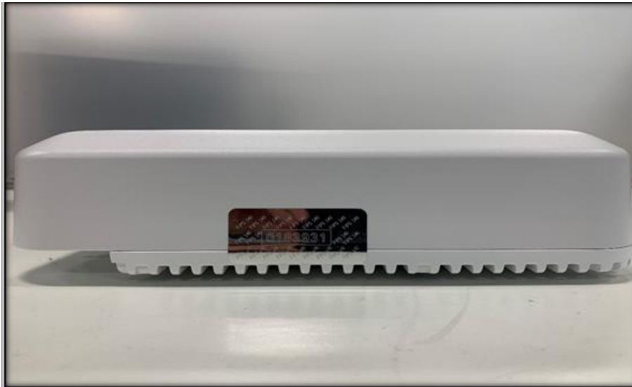
Figure 49: TEL Placement 3