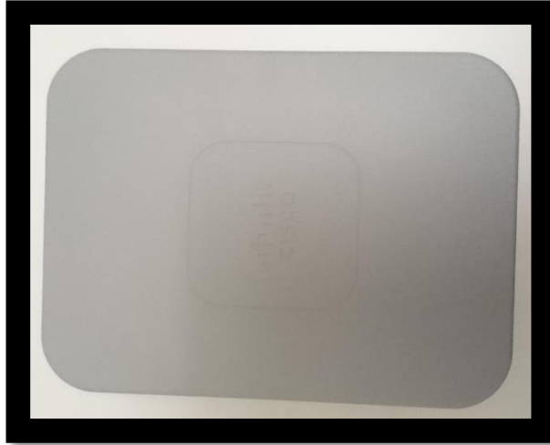
Figure 5: Top