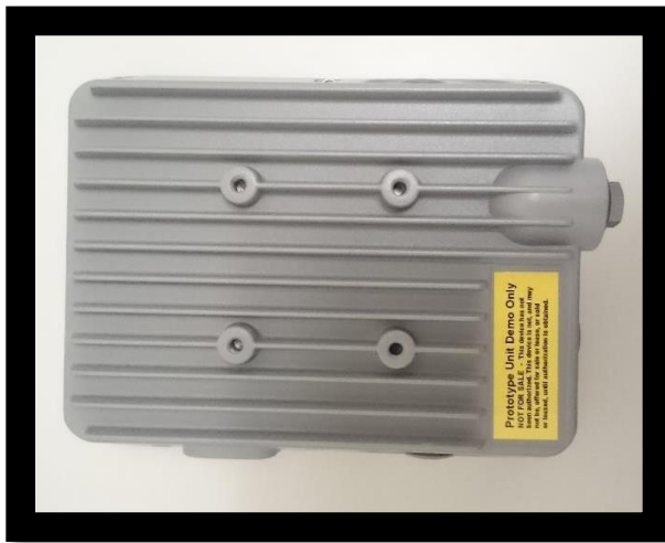
Figure 6: Bottom