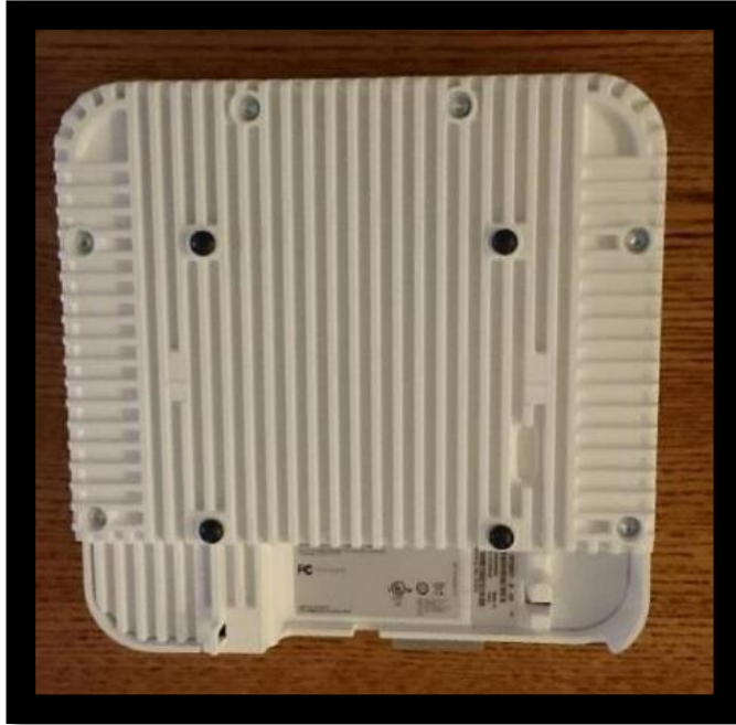
Figure 18: Bottom