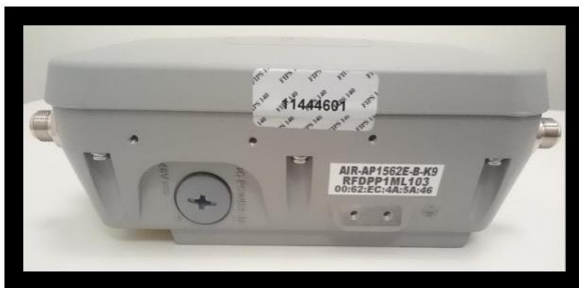
Figure 38: TEL Placement 5