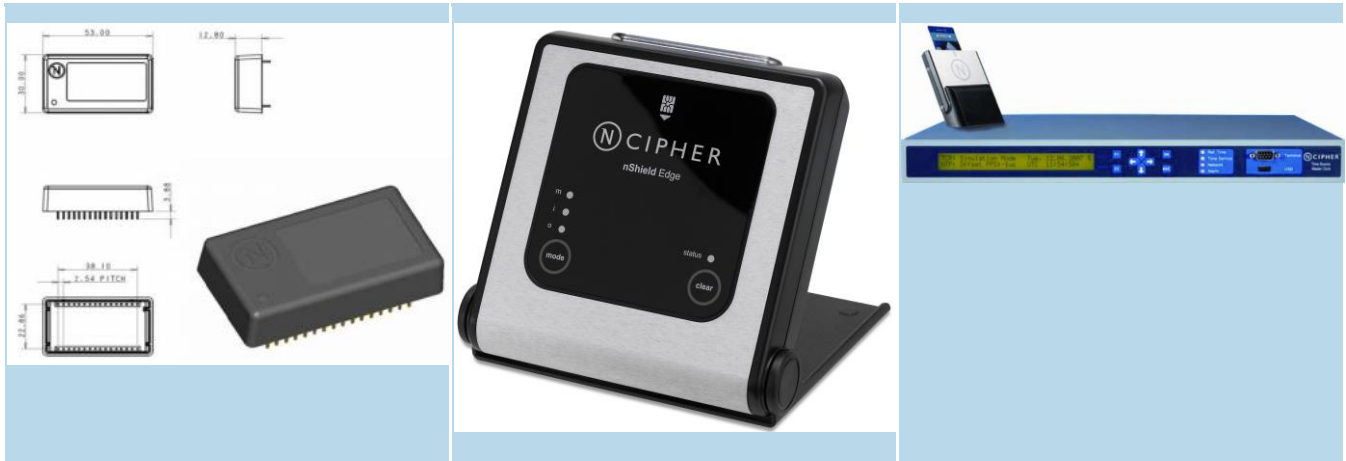
Table 2 nShield MiniHSM (left), nShield Edge (middle) and TSMC (right)

The cryptographic boundary is delimited in red in the Figures below. It is delimited by the component package.