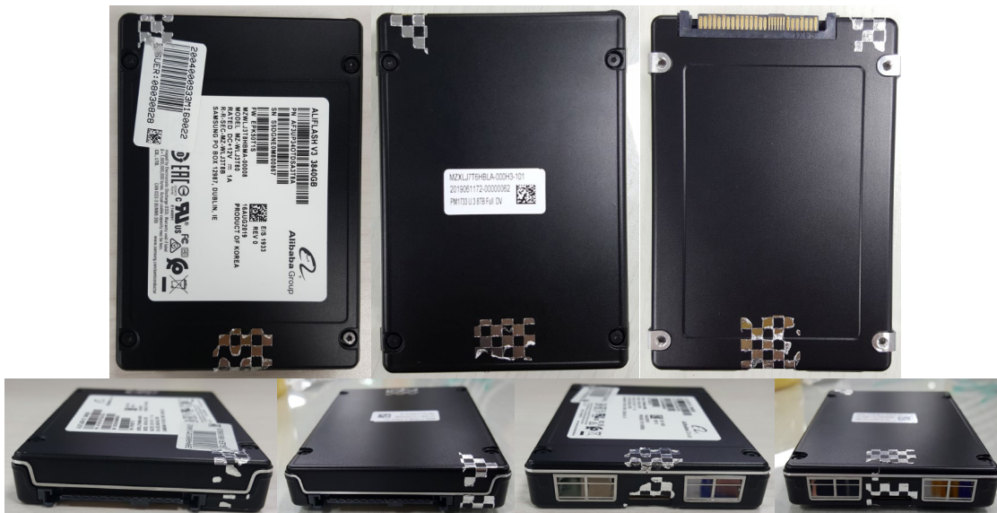
Exhibit 17 – Example of Signs of Tamper

NOTE 5: Samsung Electronics Co., Ltd has excluded the following components as per AS01.09: