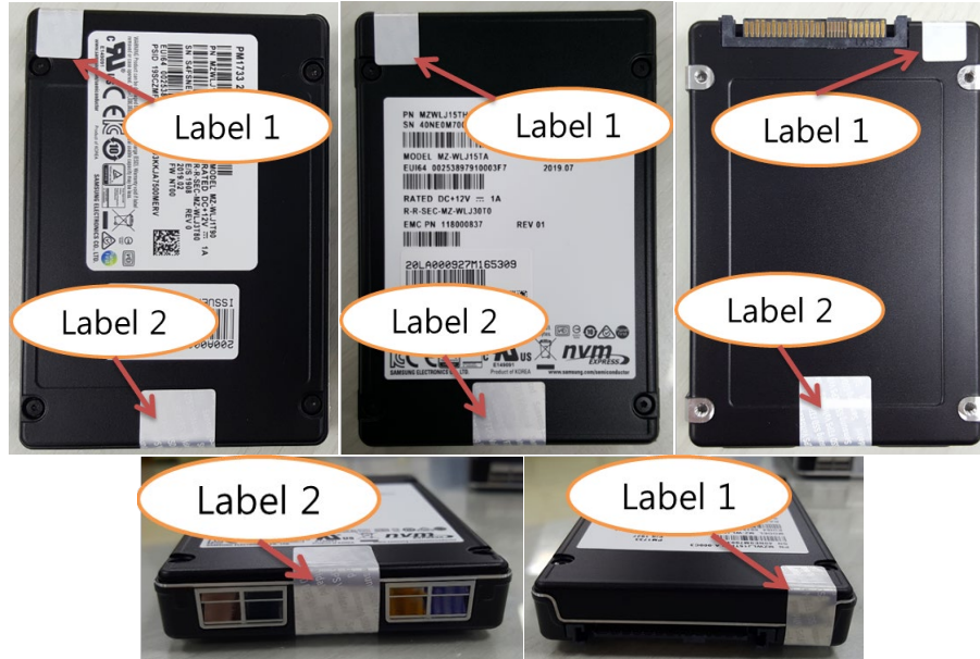
Exhibit 16 – Tamper Evident Label Placement