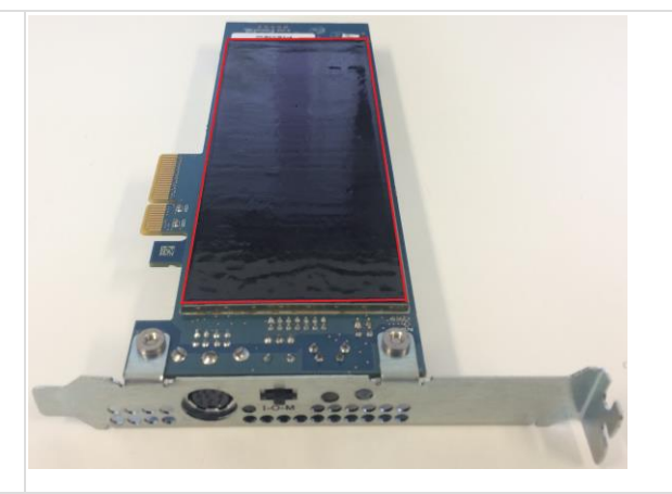
Table 4 Cryptographic module boundary