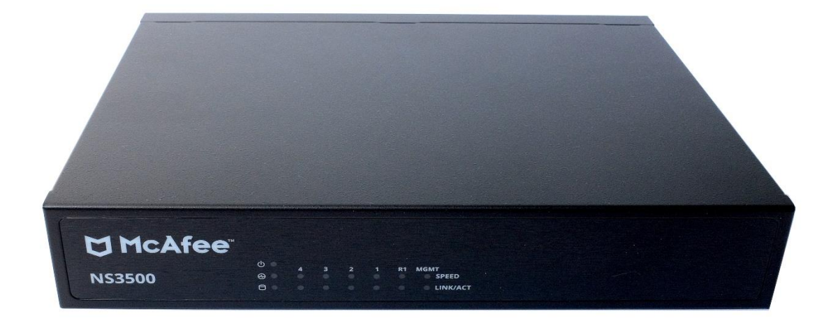
Figure 1 – Images of NS3500

Figure 1 shows the module configuration and the cryptographic boundary.