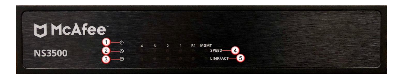
Figure 2 – NS3500 Front Panel

Figures 2 and 3 show the modules' front and rear panels and Tables 2 and 3 list the modules' ports and interfaces.