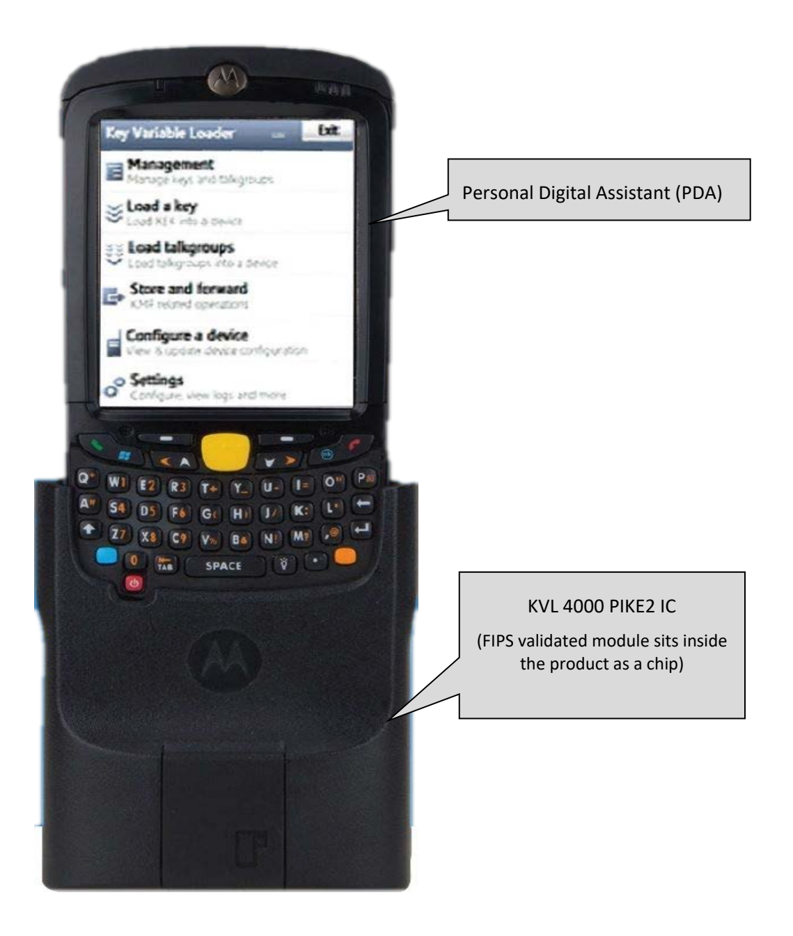
Figure 1: KVL 4000 Key Variable Loader (KVL)

The KVL 4000 Key Variable Loader (KVL) production diagram is shown in the Figure 1 below. The KVL 4000 PIKE2 IC in the Security Adapter provides data security services required by the KVL 4000 key loader.