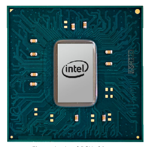
Figure 1 – Intel PCH chipset