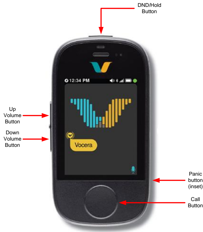
Figure 4 – Vocera V5000 Smartbadge Buttons

The badge’s physical interfaces (manual controls, physical indicators, and physical ports) map to logical interfaces supported by the module. The module’s logical interfaces are at a low level in the firmware. The module isolates communications to logical interfaces that are defined in the firmware as an API 32 . The API is mapped to the following four logical interfaces: