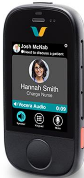
Figure 1 – Vocera V5000 Smartbadge

The Vocera V5000 Smartbadge is a wearable communication device that enables clinician agility and accelerates patient care. Small and lightweight (see Figure 1), the Smartbadge redefines healthcare communications by bringing together voice calling, secure messaging, and alerts and alarms in a lightweight wearable.