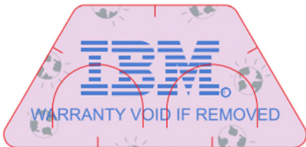
Figure shows TEL2 (blue Counterfeit Label)