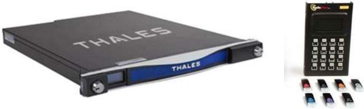
FIGURE 2-3: LUNA NETWORK HSM T-SERIES (WITH T7 INSTALLED), PED AND PED KEYS

Figure 2-3 shows a Luna Network HSM (T-Series), one of the embedments for the Luna T7 Cryptographic Module, and an external PED device and PED Keys.