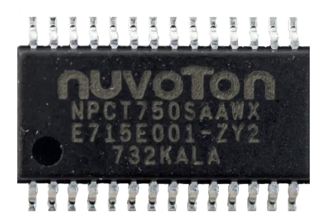
Figure 3. LAG019 in TSSOP28 Package

The physical cryptographic boundary of the Module is the outer boundary of the chip packaging.