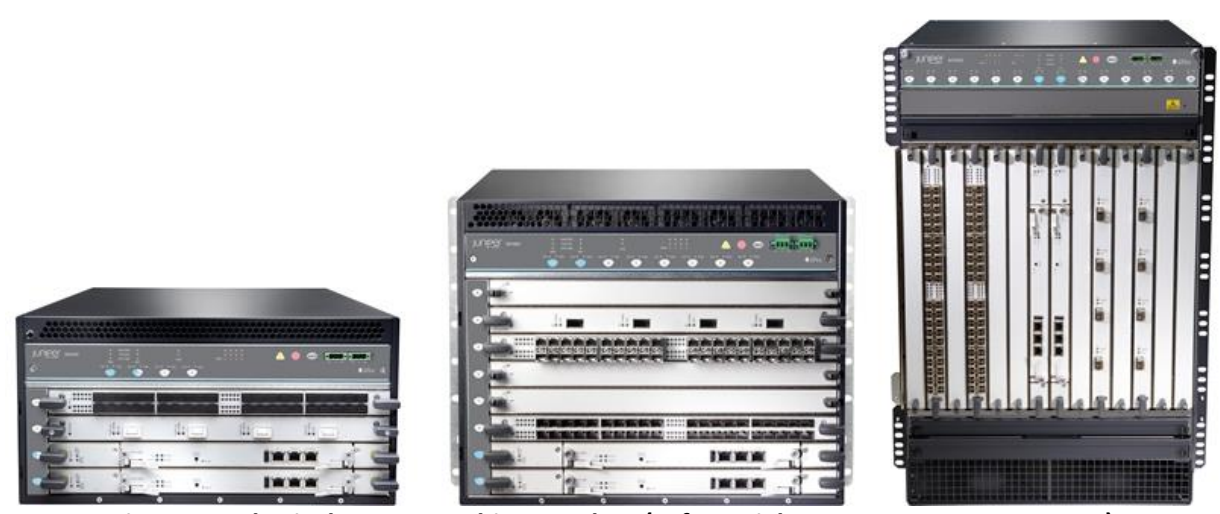
Figure 1 – Physical Cryptographic Boundary (Left to Right: MX240, MX480, MX960)

The images below depict the physical boundary of the modules, including the Routing Engine, the MACsec line card (the MPC7E-10G for the MX Series and the EX9200-40XS for the EX Series) and SCB. The boundary excludes the non-crypto-relevant line cards included in the figure. The modules exclude the power supplies from the requirements of FIPS 140-2. The power supplies do not contain any security relevant components and cannot affect the security of the module.