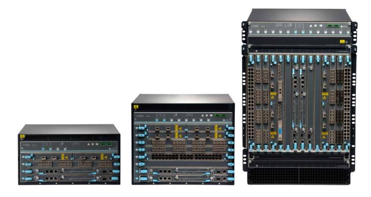
Figure 2 – Physical Cryptographic Boundary (Left to Right: EX9204, EX9208, EX9214)