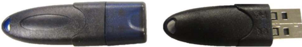
Figure 1 - ST3H ACE PKI Token [ Part No: ST3HAce-A1 ]

This document defines the Security Policy for the ST3H ACE cryptographic module, hereafter denoted as the Module. The Module is a USB token containing Securemetric's own SCOS which is embedded in a Hongsi HS32 Integrated Circuit (IC) chip and has been developed to support Securemetric's ST3H ACE USB token. The Module is designed to provide strong authentication and identification and to support network login, secure online transactions, digital signatures, and sensitive data protection.