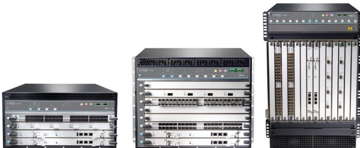
Figure 1 – Physical Cryptographic Boundary (Left to Right: MX240, MX480, MX960)

The image below depicts the physical boundary of the modules. The boundary includes the Routing Engine, MS-MPC, and SCB/SFB. The boundary excludes the non-crypto-relevant line cards included in the figure. The modules exclude the power supplies from the requirements of FIPS 140-2. The power supplies do not contain any security relevant components and cannot affect the security of the module.