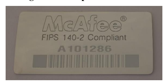
Figure 6 – Tamper-Evident Seal

Figure 6 below is an example of the tamper-evident seals applied to the module.