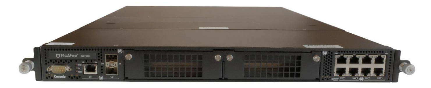
Figure 1 – Image of NS7500

They are Intrusion Prevention Systems (IPS) and Intrusion Detection Systems (IDS) designed for network protection against zero-day, DoS/DDoS, encrypted and SYN Flood attacks, and real-time prevention of threats like spyware, malware, VoIP vulnerabilities, phishing, botnets, network worms, Trojans, and peer-to-peer applications. The NSP Sensors connect with the Network Security Manager (NSM). The NSM is used to manage and push configuration data and policies to the Sensors. Communication between NSM and Sensors uses secure channels that protect the traffic from disclosure and modification. Authorized administrators may access the NSM via a GUI (over HTTPS) or a CLI (via SSH or a local connection). Sensors may be accessed via CLI (via SSH or a local connection) for initial setup. Once initial setup is complete, all management occurs via the NSM. The cryptographic boundary of the platform is the outer perimeter of the enclosure, excluding the removable power supplies as they are non-security relevant. The removable fan trays are protected by tamper seals. The optional network I/O modules are not included in the module boundary. Optional network I/O modules are not included in the module boundary. Figure 1 shows the module configuration and the cryptographic boundary.