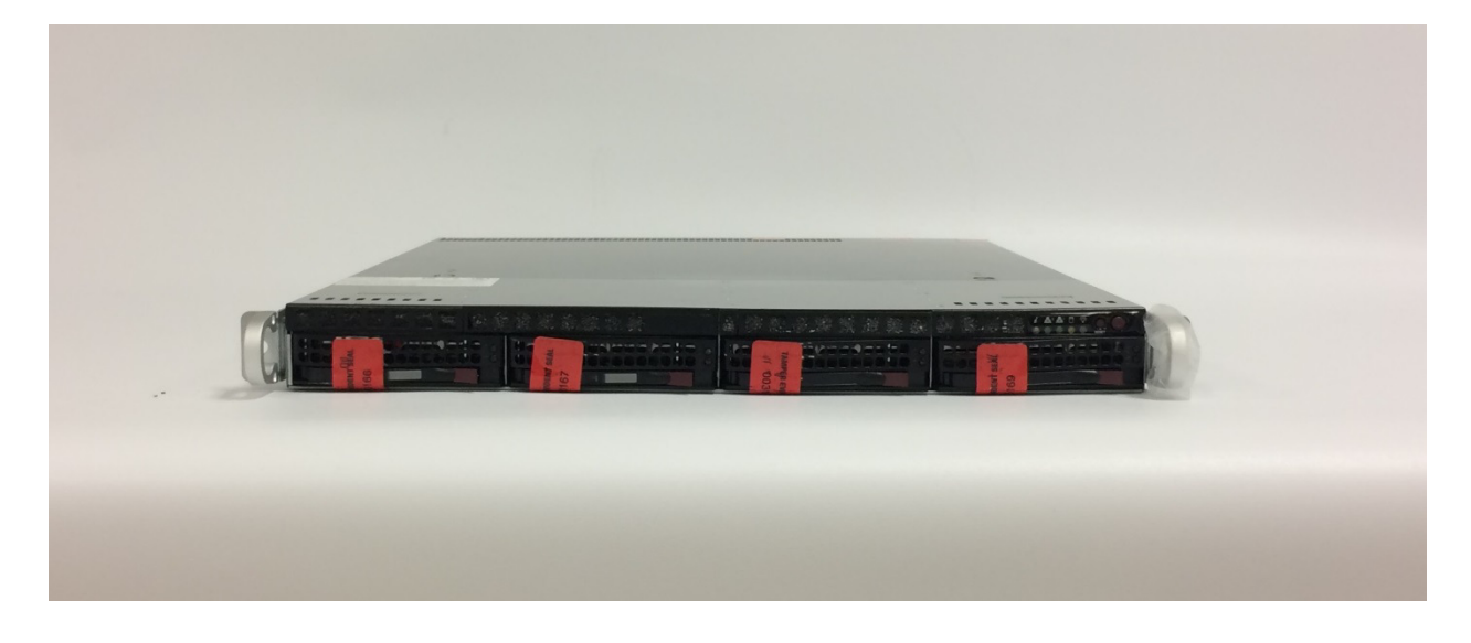
Figure 2: BotSink 3200