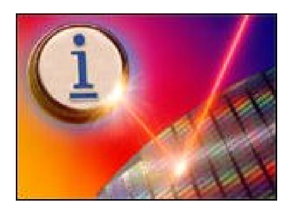
Figure 1 – The DS1954B Crypto iButton™ is laser-engraved in steel and silicon

The Crypto <u>i</u>Button provides hardware cryptographic services such as secure private key storage, a high-speed math accelerator for 1024-bit public key cryptography, and secure message digest (hashing). In FIPS 140-1 terminology the Crypto <u>i</u>Button is a "multi-chip standalone cryptographic module"; however, the Crypto <u>i</u>Button actually provides all its services using a single silicon chip packaged in a 16mm stainless steel case. Thus, the <u>i</u>Button can be worn by a person or attached to an object for up-to-date information at the point of use. The steel button is rugged enough to withstand harsh outdoor environments, and is durable enough for a person to wear everyday on a digital accessory like a ring, key fob, wallet, or badge.