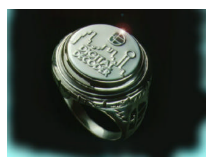
Figure 3 – The Crypto <u>i</u>Button Mounted as a Signet Jewel of a Ring. It can be attached to any personal accessory

<u>i</u>Button will stand up to the harsh conditions of daily wear, including dropping it, stepping on it, and inadvertently passing it through the washing machine and dryer.