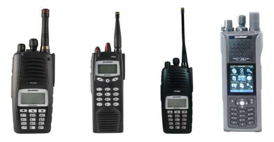
Figure I – HALM Portable Terminals (Left to Right: 5400, 7200, 7300, and Unity)

L3Harris is a leading supplier of systems and equipment for public safety, federal, utility, commercial, and transportation markets. Their products range from the most advanced IP<sup>1</sup> voice and data networks, to industry-leading multiband/multimode radios, and even public safety-grade broadband video and data solutions. Their comprehensive line of software-defined radio products and systems support the critical missions of countless public and private agencies, federal and state agencies, and government, defense, and peacekeeping organizations throughout the world. This Security Policy documents the security features of the Harris AES Load Module (HALM) incorporated into the L3Harris 5300 (Mobile 800Mhz only), 5400 (Portable only), 5500 (Portable only), 7200, 7300, Unity, XG-25P, XG-25M, XG-75 UHF-L, XG-75 VHF, XG-75 (800 MHz) and other terminal products, which are single and multi-band, multi-mode radios that deliver end-to-end encrypted digital voice and data communications, and are Project 25 Phase 2 upgradable<sup>2</sup>. Figure 1 and Figure 2 display some of the many radio terminals the Harris AES Load Module is incorporated into.