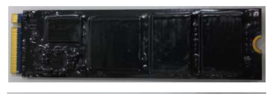
<u>Exhibit 1</u>– Cryptographic Module Configurations