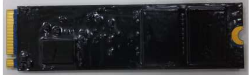
<u>Exhibit 2</u> - Specification of the Seagate BarraCuda 515 Cryptographic Boundary (From top to bottom: top side, bottom side).