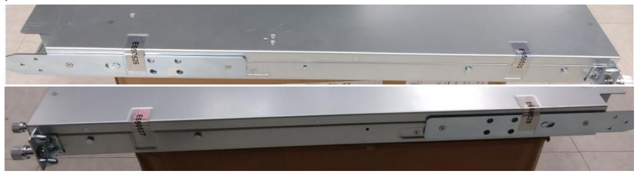
Figure 2 – Tamper Evidence Label Locations

Figure 2 identifies the locations of the four tamper evidence labels applied during the manufacturing process.