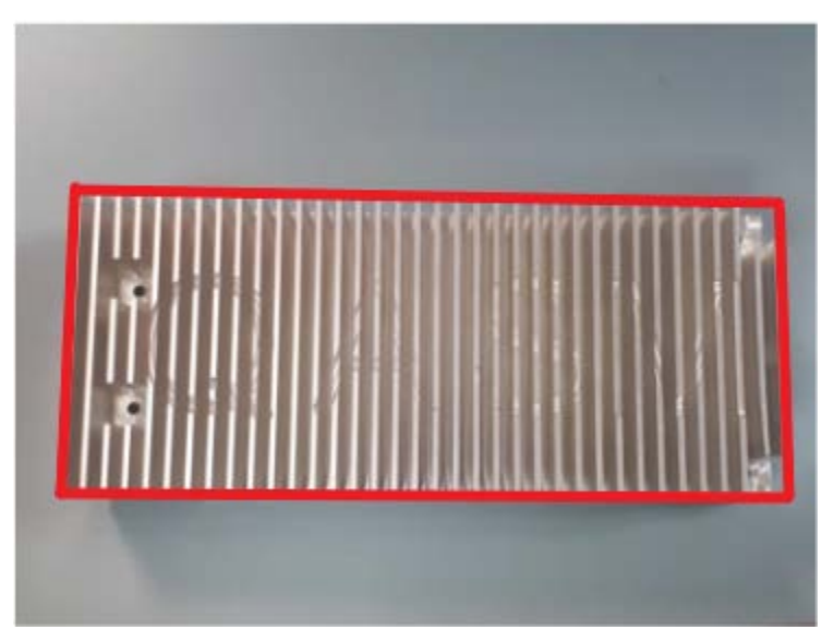
Figure 1 - Picture of QASM and Physical Boundary

The QASM is a security level 3 multi-chip standalone cryptographic hardware module. Figure 1 shows the QASM as well as the cryptographic boundary in red. The aluminum enclosure containing the QASM acts as a physical boundary, and the cryptographic boundary is contained within this physical boundary.