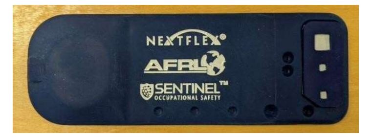
Figure 1 – NextFlex AirGuardian

The NextFlex AirGuardian, or AirGuardian, provides real-time monitoring of health and safety metrics, as defined by the Occupational Safety and Health Administration (OSHA) for maintainers working in confined spaces. The AirGuardian (see Figure 1) employs a network of off-the-shelf physiological sensors with custom-designed flexible hybrid electronic (FHE) environmental sensors for monitoring oxygen levels, temperature, and humidity as the maintainer works. The sensor network is held in an armband and worn by the maintainer.