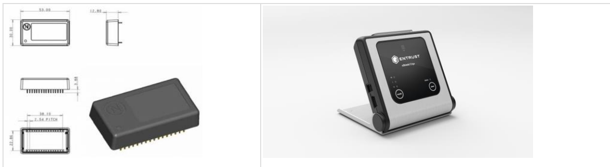
Table 3 nShield MiniHSM (left) and nShield Edge (right)

The table below shows the nShield MiniHSM and the nShield Edge