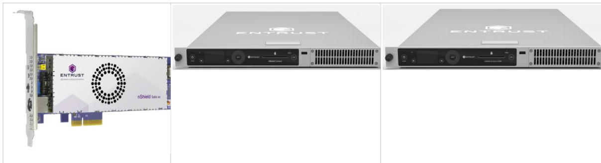
Table 3 nShield Solo XC (left), nShield Connect XC (centre), and nShield HSM i (right)

The table below shows the nShield Solo XC HSM, the nShield Connect XC and the nShield HSM i appliances.