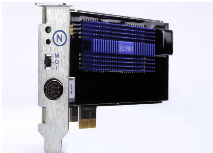
Figure 1 nShield Solo+

The Figure below shows the nShield Solo+ HSM.