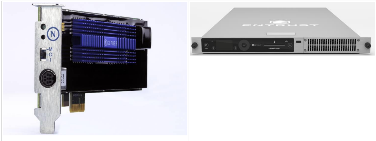
Table 3 nShield Solo (left) and nShield Connect (right)

The cryptographic boundary is delimited in red in the images in the table below. It is delimited by the heat sink and the outer edge of the potting material on the top and bottom of the PCB.