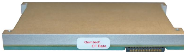
Figure 1 - Front View of Gen 2 TRANSEC Module

The cryptographic boundary is the physical boundary of the device. The entire contents of the module, including all hardware, firmware, and data, are protected by a metal cover on the top side and a hard-plastic material on the bottom side of the module. The module plugs into a host modem that controls the module and provides some level of module status to the user. The CO also can connect directly to the module’s encrypted management interfaces to load keys, change firmware, and view extended status information.