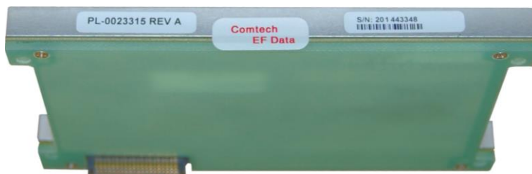
Figure 2 - Back View of Gen 2 TRANSEC Module