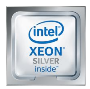
Figure 2 – CPU, Intel Xeon Silver 4208