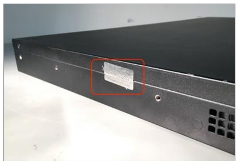
Figure 2 - CSa 1000 Tamper Seal #1 - Chassis Seam