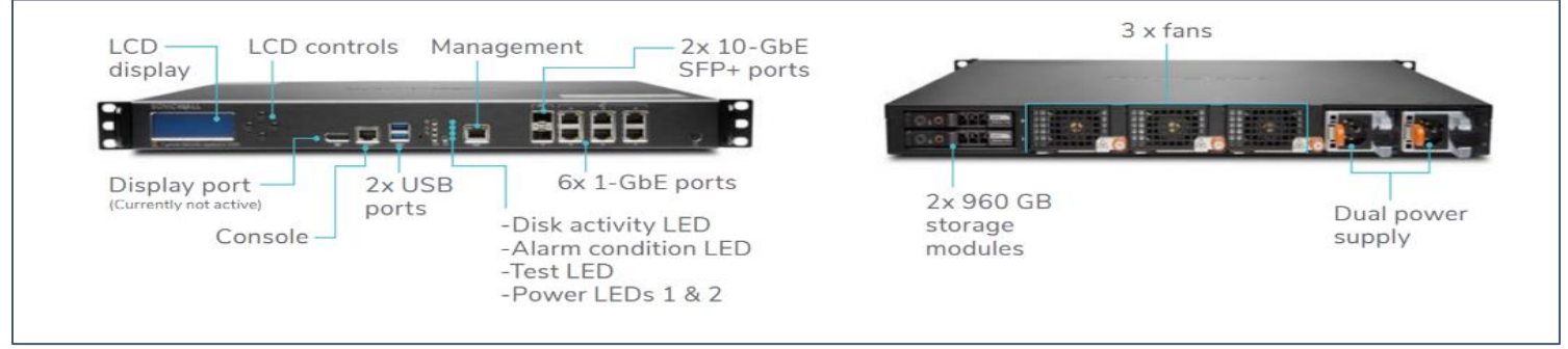
Figure 1 – Physical form of Module Configuration