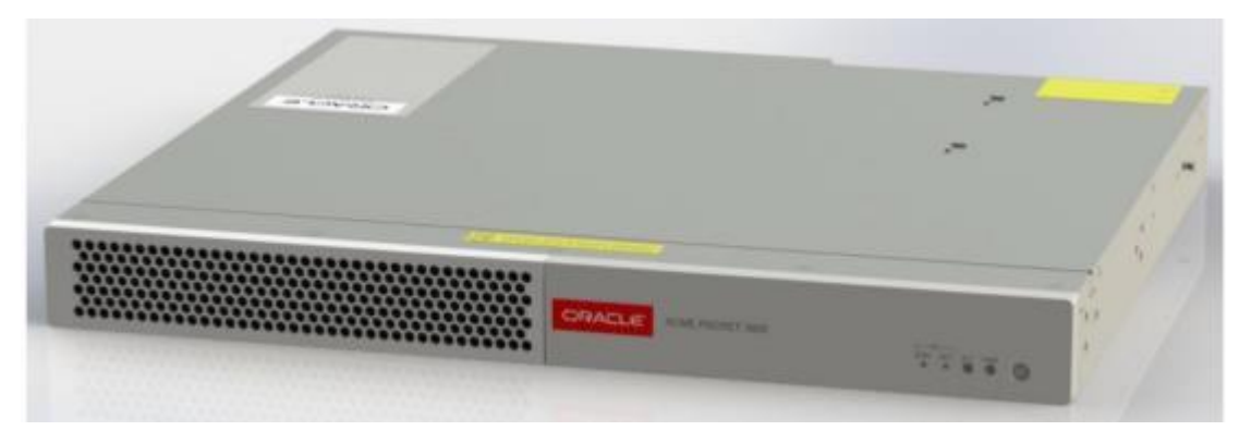
Figure 2: Acme Packet 3900