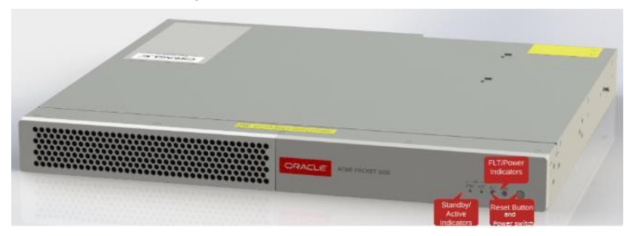
Figure 7: Acme Packet 3900 - Front View