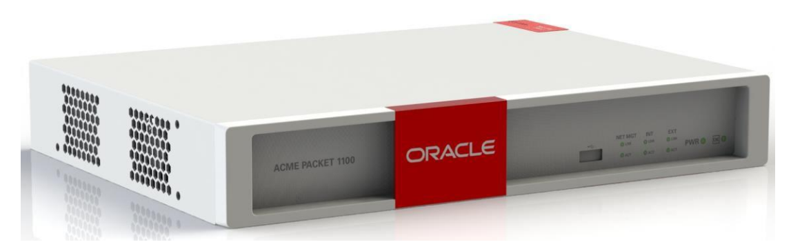
Figure 1: Acme Packet 1100

A representation of the cryptographic boundary is defined below: