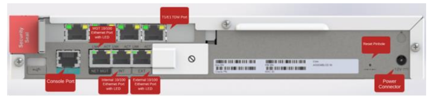
Figure 6: Acme Packet 1100 - Rear View