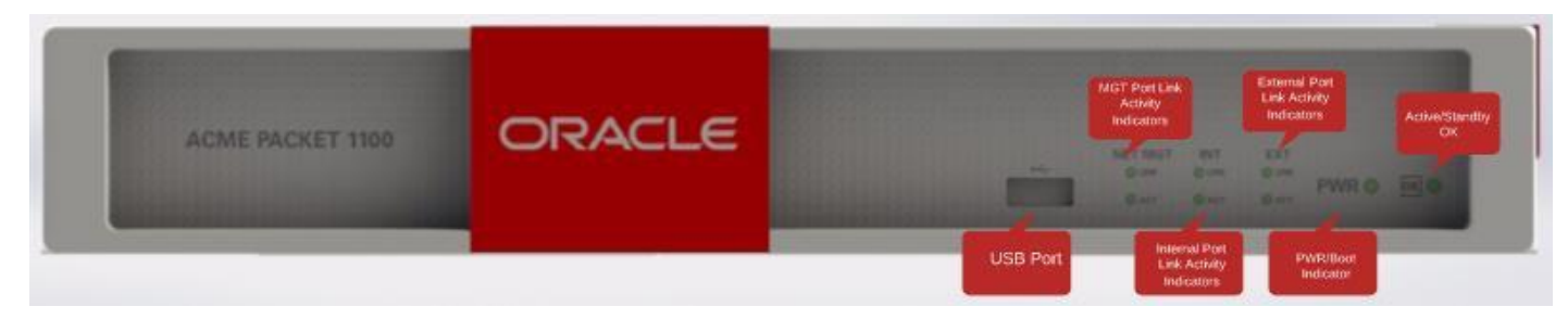
Figure 5: Acme Packet 1100 – Front View