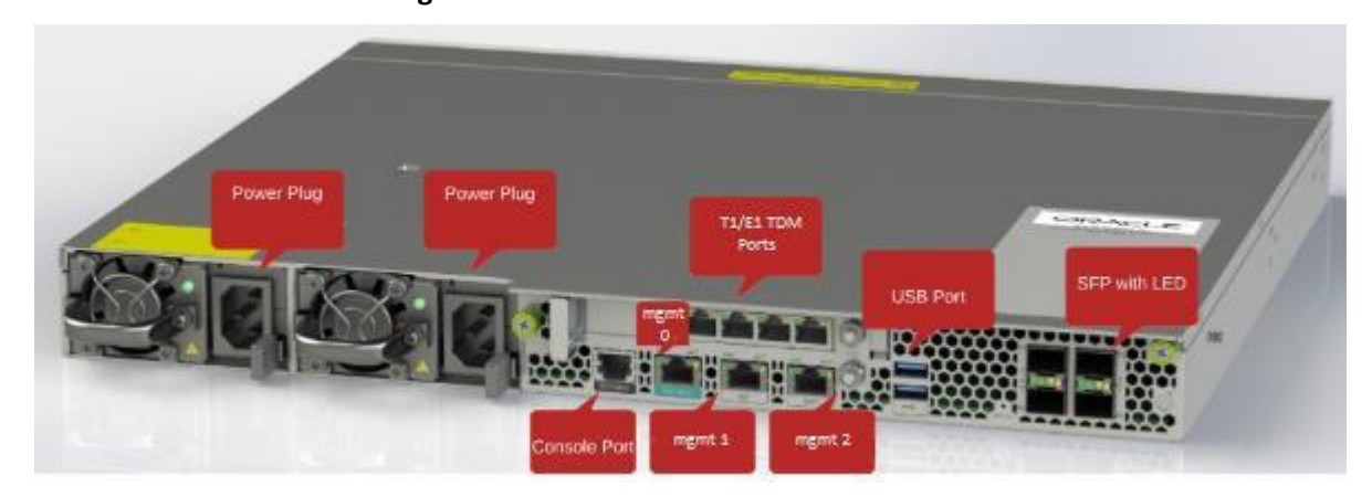
Figure 8: Acme Packet 3900 – Rear View