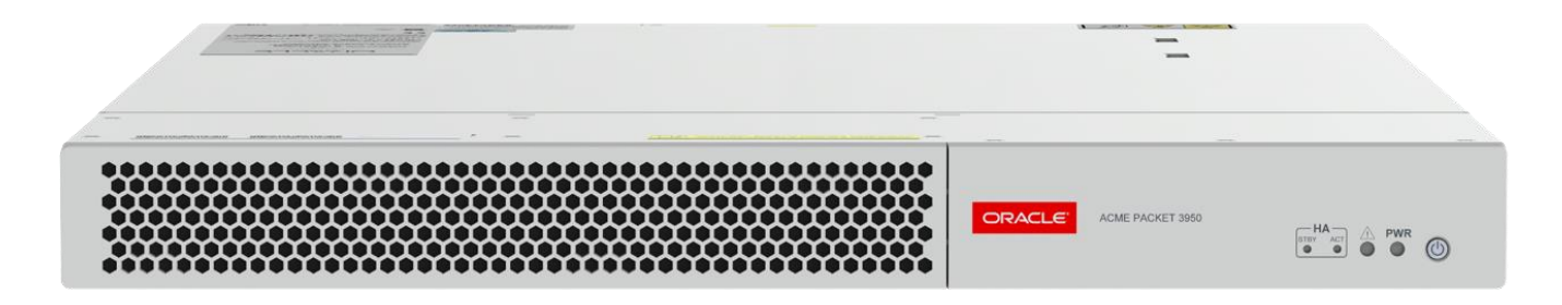
Figure 3: Acme Packet 3950