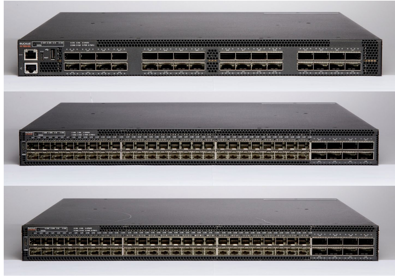
Figure 2 - ICX 7850 (Front)