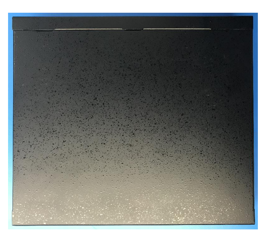
Figure 5 EC-XS Top View

The EC-XS side views above show the factory-installed louver which ensures FIPS enclosure opacity.