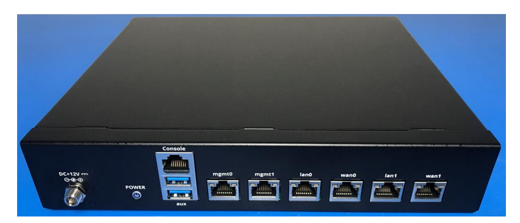
Figure 1 EC-XS Front View