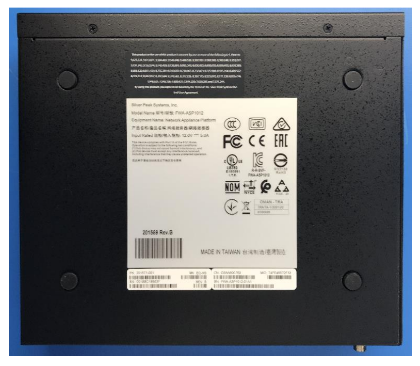
Figure 6 EC-XS Bottom View