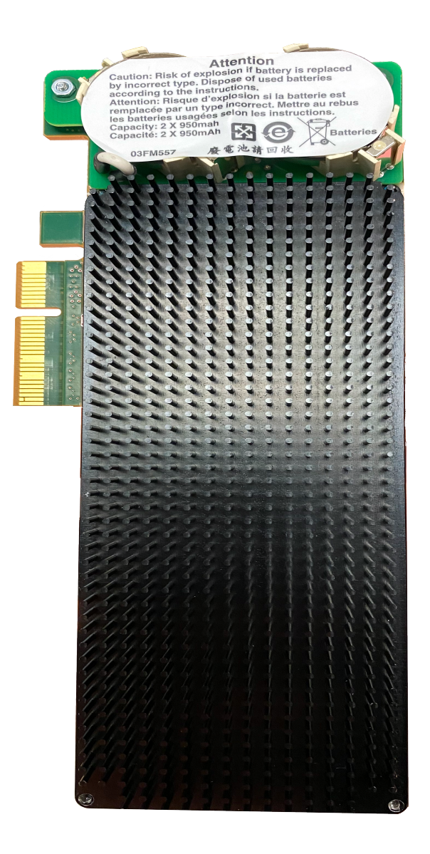
Figure 1 - Module