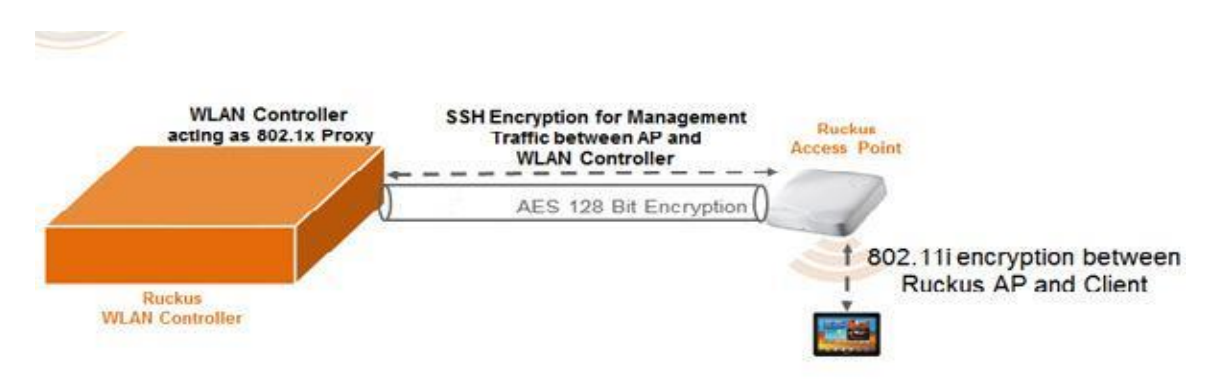
Figure 1: Encryption between AP and Controller

The SmartZone 300 (SZ-300) Flagship Large Scale WLAN Controller is designed for Service Provider and Large Enterprises, which prefer to use appliances. The Carrier Grade platform supports comprehensive integrated management functionality, high performance operations and flexibility to address many different implementation scenarios. The SZ-300 supports up to 10,000 AP and 100,000 Clients per unit.