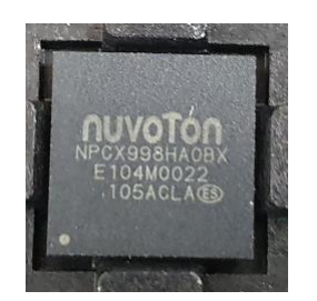
Figure 2: Nuvoton NPCX998HA0BX

Figure 2 and 3 shows a picture of the NPCX998H (e.g., EC) and the NPCD321H (e.g., SIO) in which the subchip module is embedded.