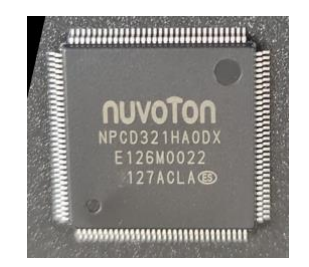
Figure 3: Nuvoton NPCD321HA0DX