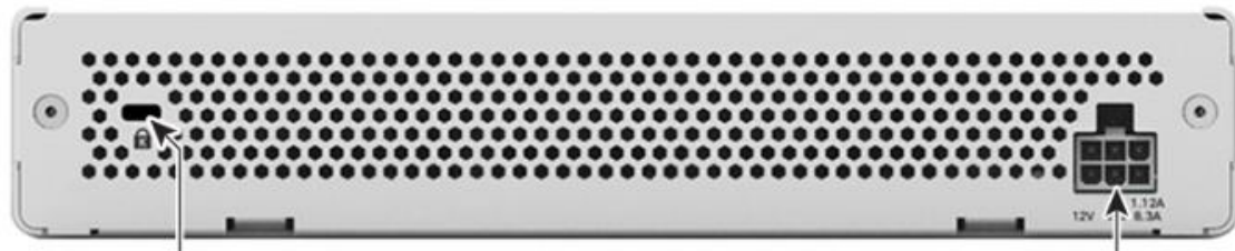
Figure 6: Back Cisco Catalyst 9800-L