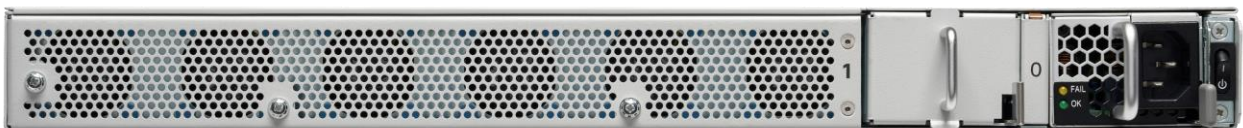
Figure 2: Rear Cisco Catalyst 9800-40