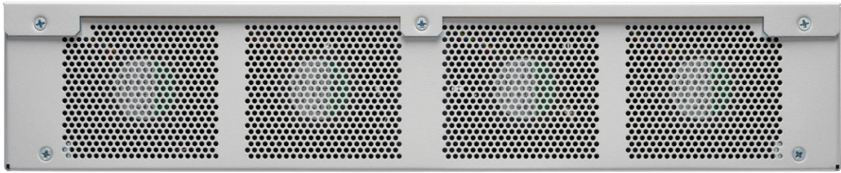
Figure 4: Rear Cisco Catalyst 9800-80