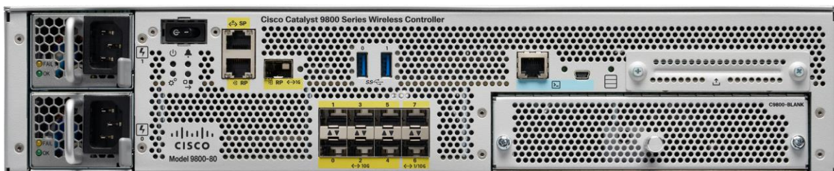
Figure 3: Front Cisco Catalyst 9800-80