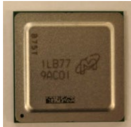
Figure 1 – Micron 7400 ASIC

The Module is intended for use by US Federal agencies or other markets that require FIPS 140-3 validated cryptographic controllers. The Module is embedded in the ASIC 7400 Controller package (see Figure 1 below).