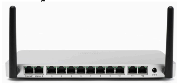
Figure 4 - MX68CW Rear View