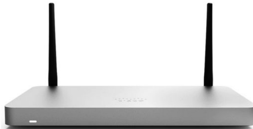
Figure 3 - MX68CW Front View