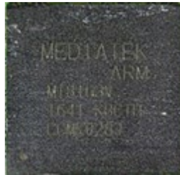
Figure 7 - ARMv8 Cortex-A53

The following table lists the Vendor affirmed operational environment: