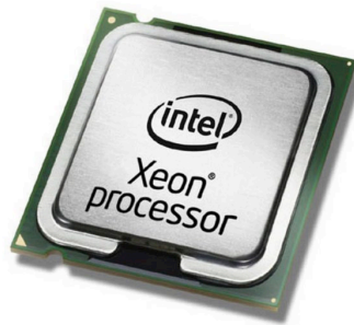
Figure 6 - Intel Xeon Gold 6138

Please note that Figures 1-5 are the tested platforms and not the module itself.