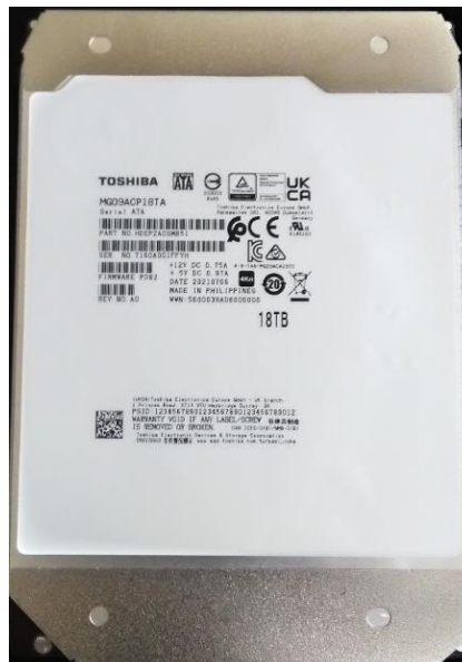
Figure 2: MG09ACP18TA