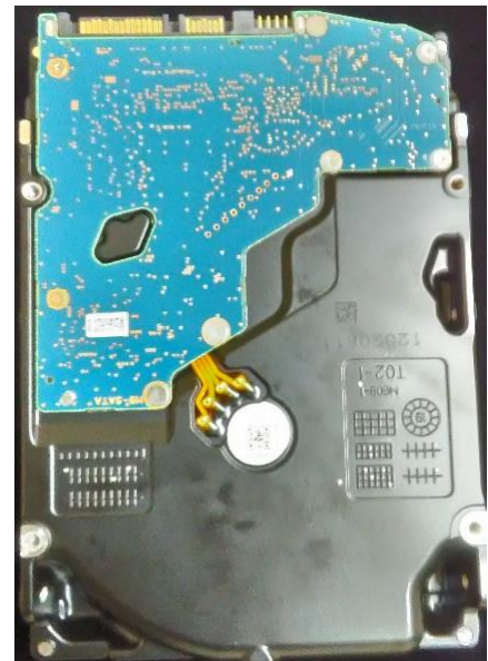
Figure 3: PCA side

Figure 4 shows the CM's block diagram. In this diagram, the cryptographic boundary of the CM,