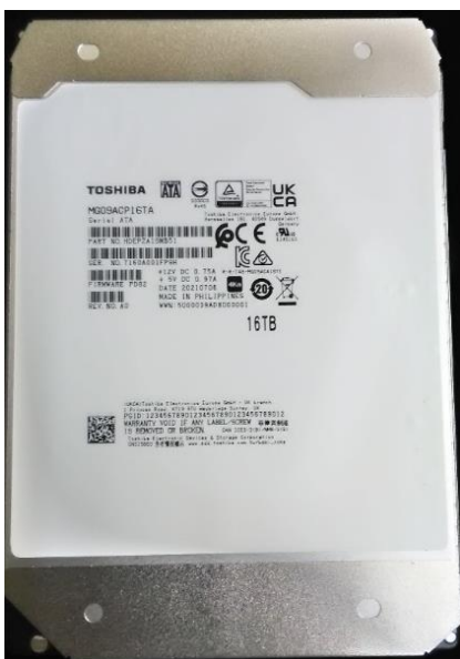
Figure 1: MG09ACP16TA