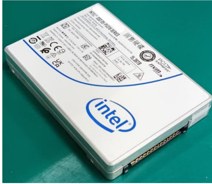
Figure 1 – U.2 Module Picture (Intel Branding)

The multi-chip embedded Module, pictured below in Figure 1, is intended for use by US Federal agencies and other markets that require FIPS 140-3 validated Self Encrypting Solid State Disks.