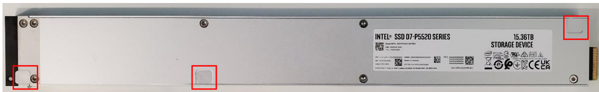
Figure 7 - E1.L Module (Intel Branded) Seal Application Locations -- Back