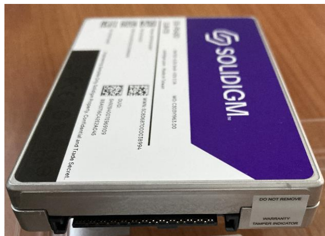
Figure 2 – U.2 Module Picture (Solidigm Branding)