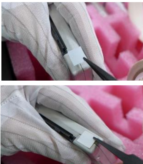
Figure 8 - Applying Tamper-Evident Seals

EFP/EFT testing of the module is not applicable as the module does not claim Security Level 3 or above.