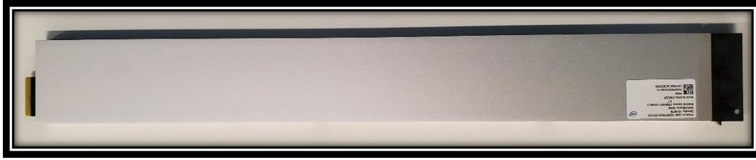
Figure 3- E1.L Module Picture (Top Side with secured black latch)