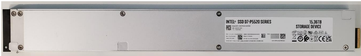
Figure 4 - E1.L Module Picture (Bottom Side with secured black latch with Intel Branding)

The cryptographic boundary is defined as the external perimeter of the SSD enclosure represented in Figures 1-4. Figure 5 below shows the module block diagram where the red dotted line depicts the module's physical perimeter.