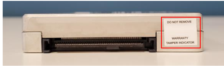
Figure 6 - U.2 Module Seal Application Locations - Front