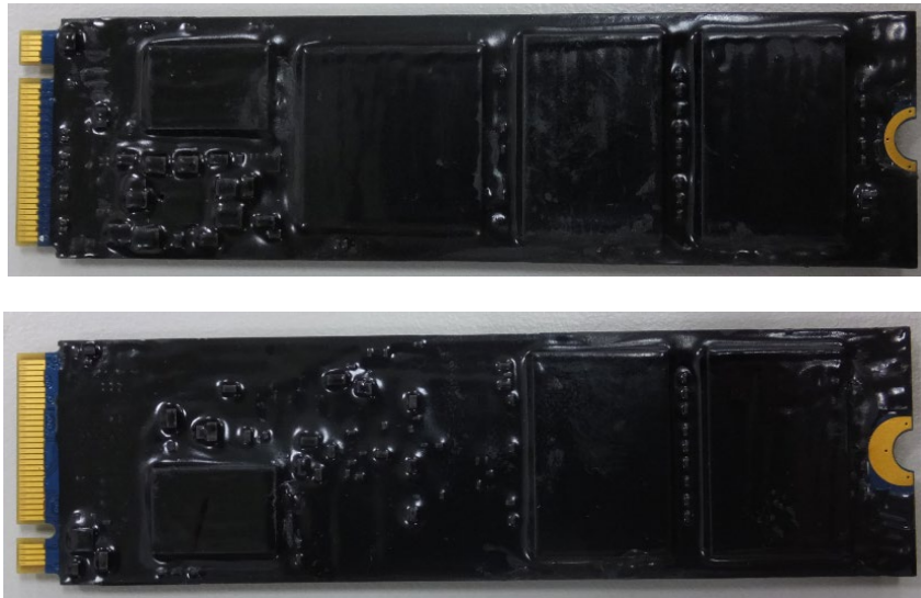
Exhibit 2 - Specification of the DIGISTOR® C Series Advanced SSD Cryptographic Boundary (From top to bottom: top side, bottom side).